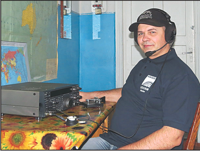
UR5IRM is the 2014 Formula Class winner.